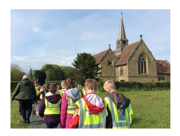
St. Luke's Church, Winmarleigh

As a Church of England Aided School our collective worship and ethos are rooted in Christian teachings and values. While parents have a right to withdraw their children from worship this will not insulate them from the Christian ethos in school